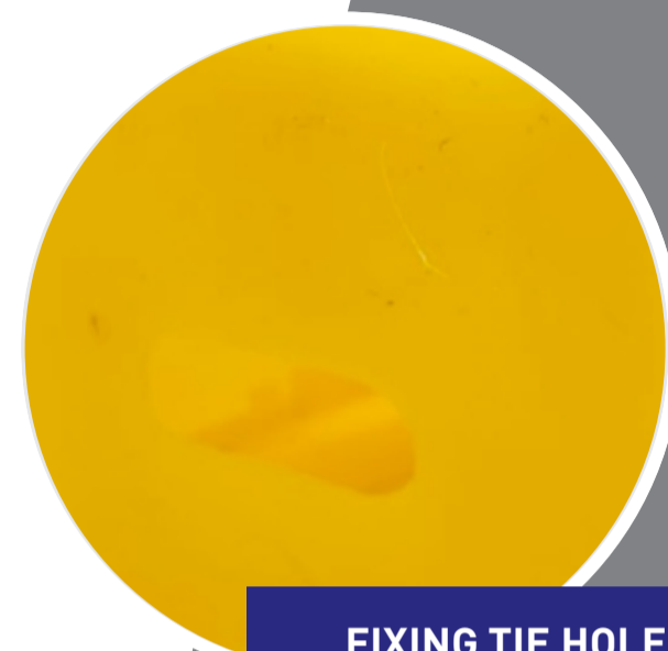
FIXING TIE HOLE