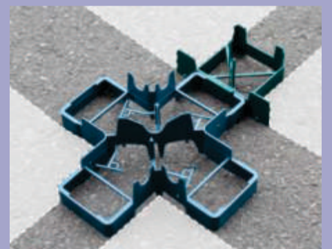
4. 200mm Internal Beam