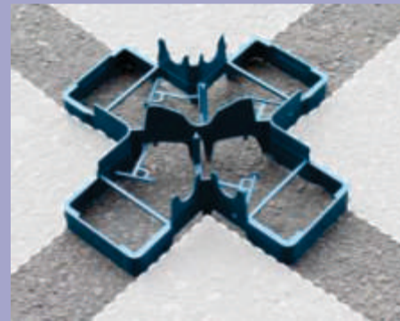
1. Standard Spacer Usage