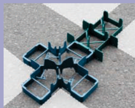
5. 300mm Internal Beam