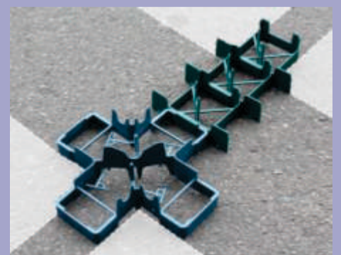
3. 400mm Internal Beam