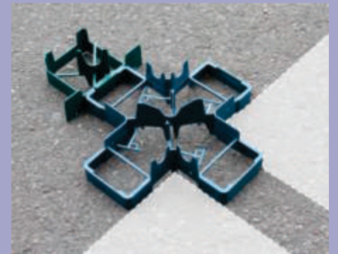
2. 300mm Edge Beam