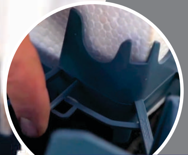
POD PIN SYSTEM