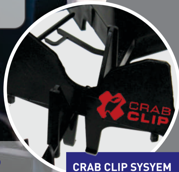
CRAB CLIP SYSTEM

“The curved bar supports makes the steel drop straight in every time” – Hawke’s Bay Builder