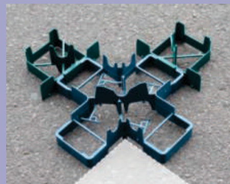
3. 300mm External Corner